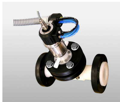
Installation on EXtract 820 with flow vessel EXflow720