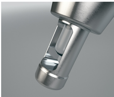
Protecting cage in process position