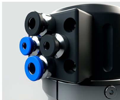
Connection board EXtract