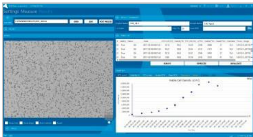
HORUS Software for recording and analysing the cell culture from a computer

The image analysis and results from the Cytonote are performed from the HORUS dedicated software. HORUS is application oriented, it provides automatic cell count, quantitative confluence determination, cell size or cell tacking. Full field images (30 mm 2 ) of the samples are stored and can be accessed and zoomed at any time. It is designed to monitor up to 6 Cytonote simultaneously for 6 parallel or independent cell cultures.