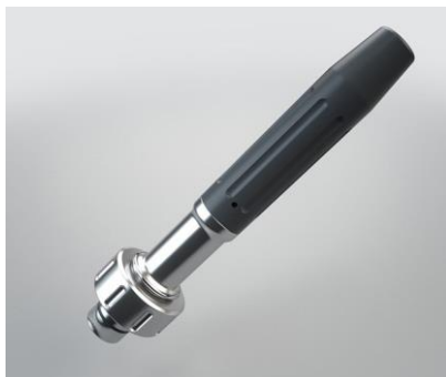
EXstatic 310 - without protection cage