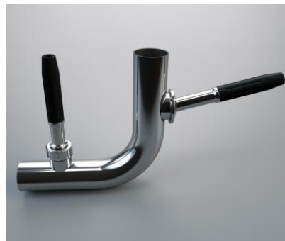
Installation example: left EXstatic 310, right EXstatic 315