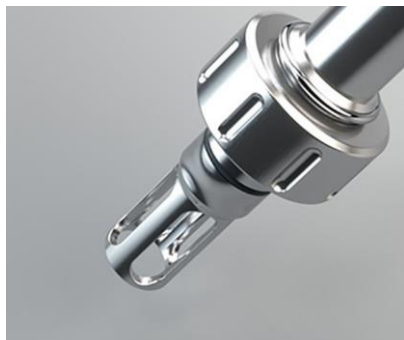
Protection cage on EXstatic 310