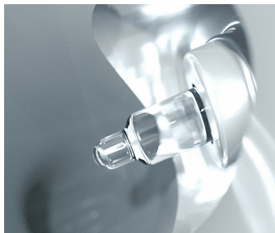
EXstatic - installation situation from inside