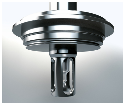
Process connection VARIVENT N with protective cage